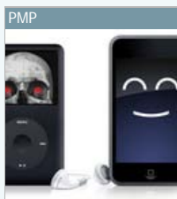
The Portable Media Player Is Dead, Long Live the... Portable Media Player